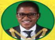
Cllr T.P. Shandu Mayor of Ilembe Municipality