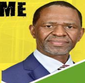
Deputy Minister of Health Dr Sibongiseni Dhlomo

Deputy Minister of Health Dr Sibongiseni Dhlomo and Cllr T.P. Shandu Mayor of Ilembe Local Municipality will host a youth programme to discuss health challenges and other social ills existing within the community.